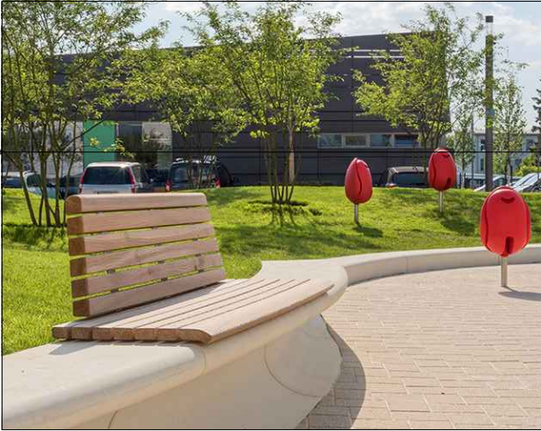
SEATING - Seating in the courtyard space