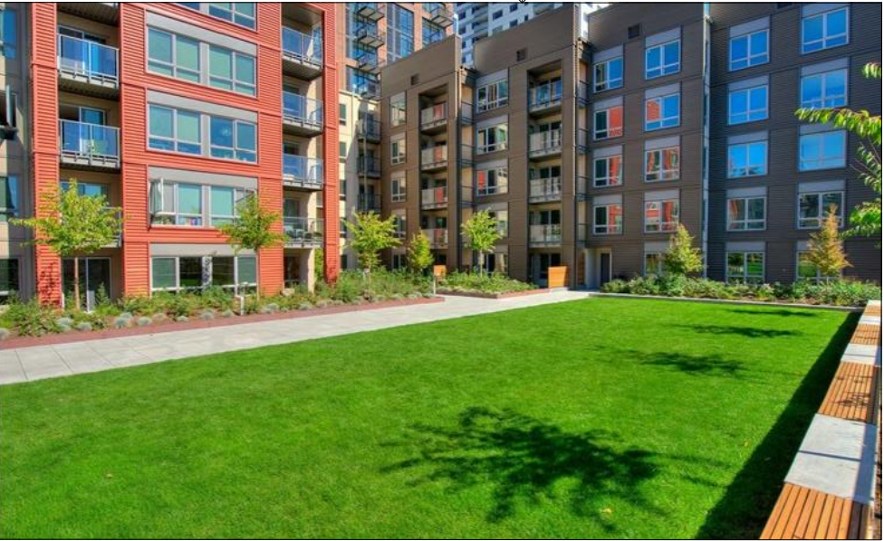
NATURAL PLAY - Lawn area and kick-about space for kids

The play area strategy caters for all age groups. Children play area for toddlers, kick-about space for younger kids and socialising space for older kids have been provided within the courtyard area.