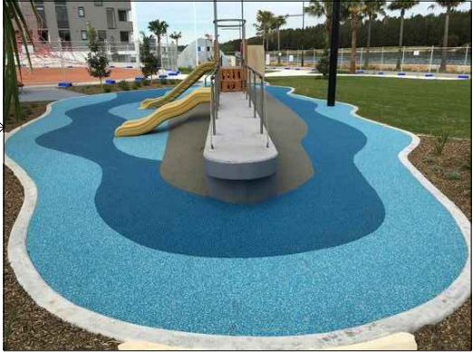
PLAY AREA - Rubber safety surface to dedicated play space