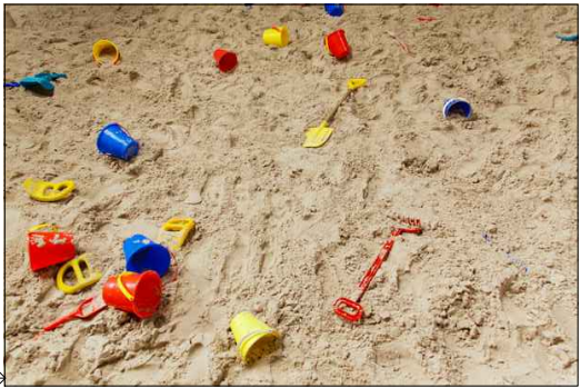
NATURAL PLAY - Sandpit to encourauge natural play