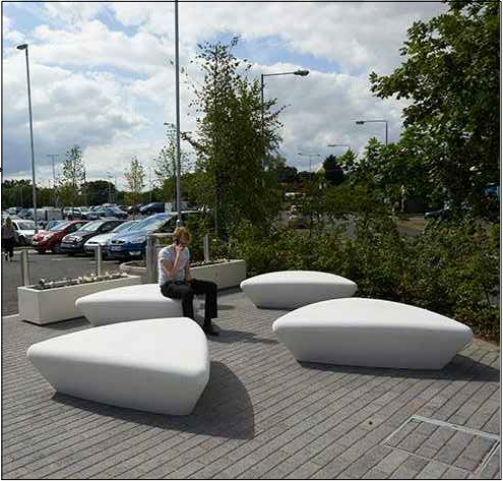
SEATING - Seating blocks in social space for older kids